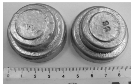
Fig. 1. Samples for testing the alloy porosity content

As the alloy was prepared in the melting furnace, it was heated up to 720 °C and the